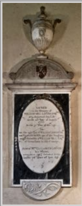
The Leeves family